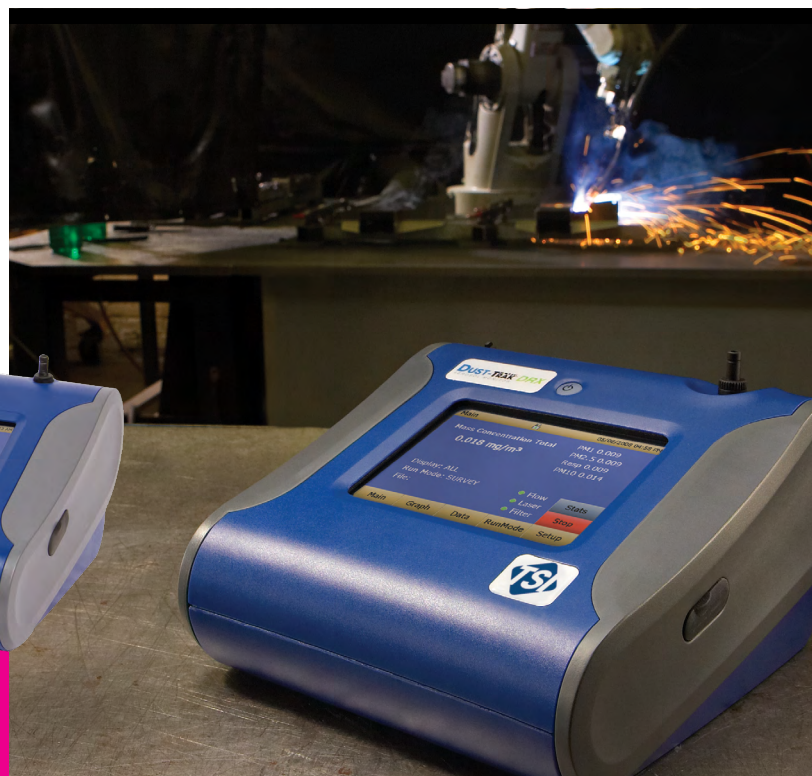
Desktop Monitor with External Pump, Model 8533EP