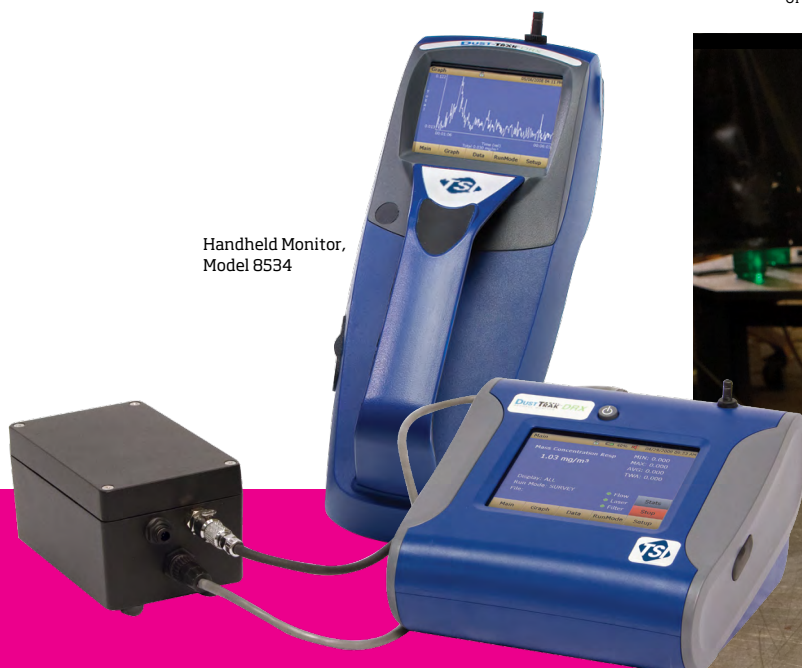
Handheld Monitor, Model 8534